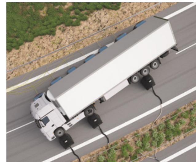
Fast, safe and damage-free recovery

Visit our website at vetter.de and check out our video showing the system in action! You'll see: This is truly advanced truck recovery! Are you interested? Then contact us right away on +49 (0) 22 52 / 30 08-660 or vetter.info@idexcorp.com ! We'll be pleased to advise you.